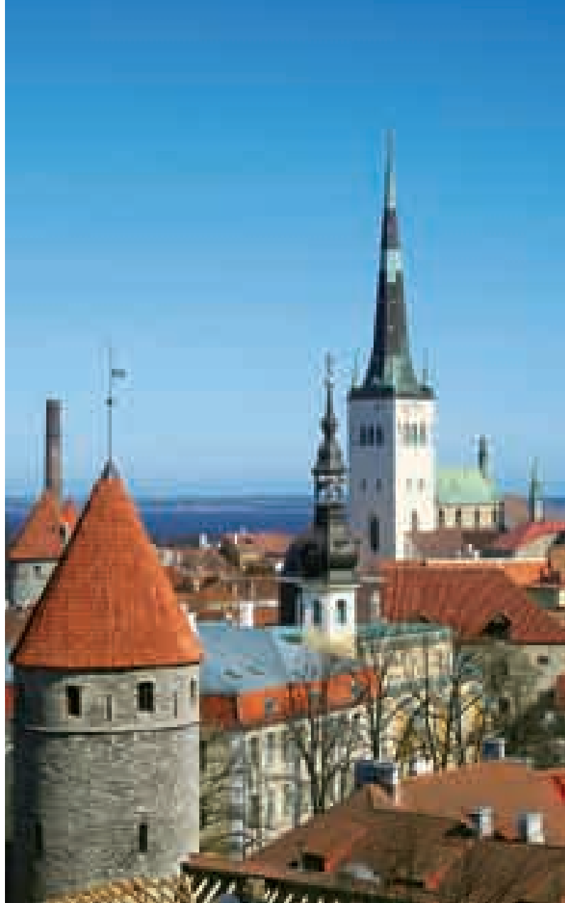
Tallinn is the Capital and largest city of Estonia.